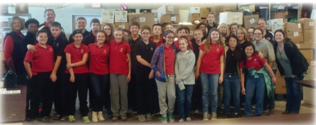
St. Paul Lutheran Church (Kingsville) students at a clothing sort on November 15, 2017