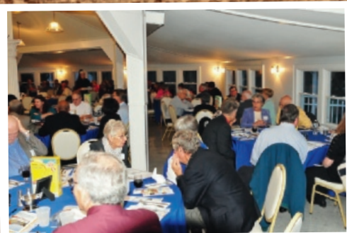
Over 130 people enjoyed a wonderful afternoon and made the 2017 Annual Dinner a huge success!