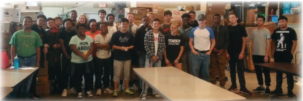
Concordia Preparatory School (Towson) students at a clothing sort on September 8, 2017

- Article and photos courtesy of Joyce Roessler -