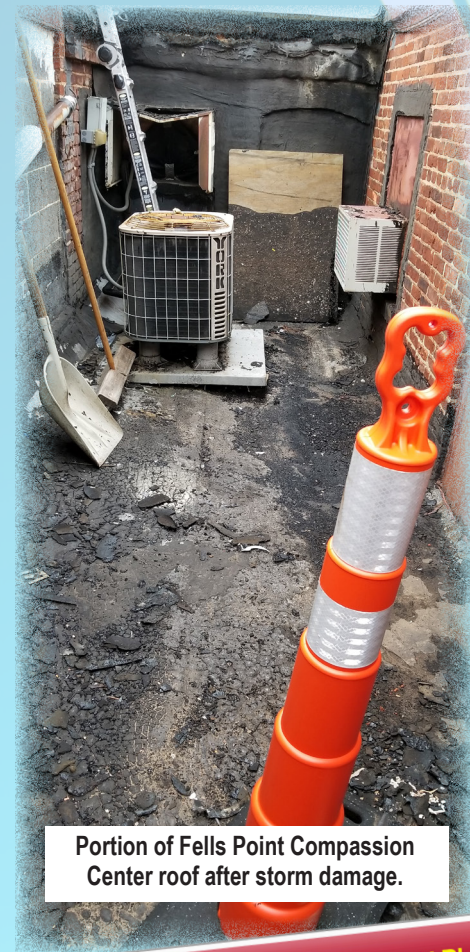
Portion of Fells Point Compassion Center roof after storm damage.

The Lutheran Church—Missouri Synod has provided Lutheran Mission Society of Maryland a Domestic Emergency Grant in the amount of $24,000 to help repair storm damage to the Fells Point Compassion Center roof.