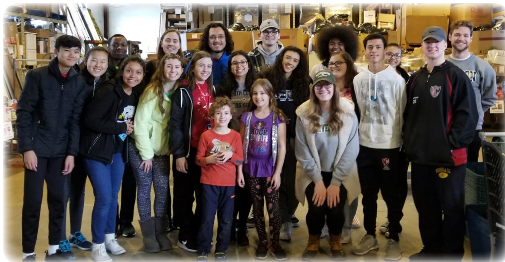
National Honor Society from North County High sorted food for gift baskets for this year's Miracle of Christmas project. The group is starting on their eleventh year of service.

Since 2008, members of the North County High School National Honor Society (NHS) have volunteered their time for projects at LMS Compassion Place headquarters.