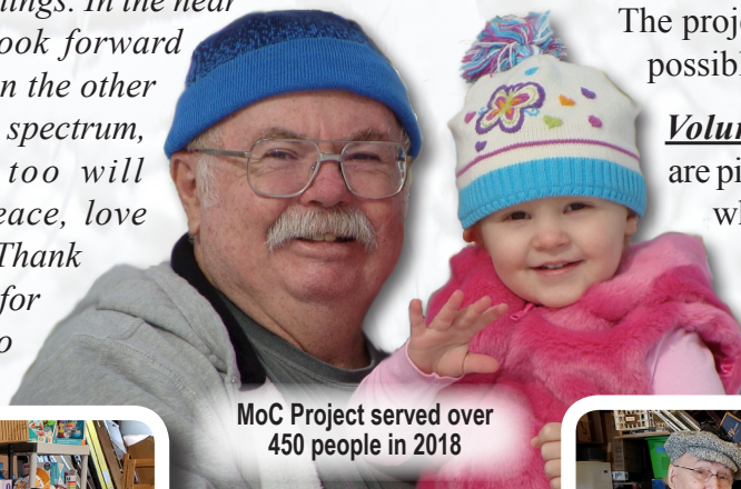
MoC Project served over 450 people in 2018