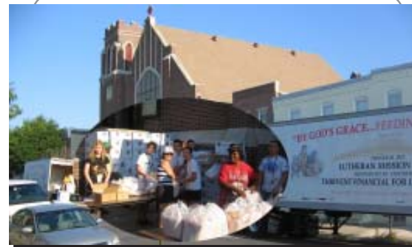
LMS "Caravan of Compassion" distributed 100,000 loaves of bread at 16 locations in 4 days. (Above: Volunteers at Amazing Grace in Baltimore prepare for bread distribution July 22, 2010)

Jesus declared, "I am the bread of life. Whoever comes to me will never go hungry, and whoever believes in me will never be thirsty." John 6:35